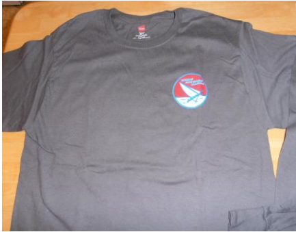
front of shirt

WSSA long sleeve t-shirts, $25.00 each plus shipping. Choice of three colors – charcoal, medium blue, and forest green. A colored WSSA logo is on the left side of chest, a stern steerer in a tall hike (thanks to Jeff Seeboth for the pose) is on the back. Send t-shirt orders to WSSA Secretary/Treasurer.