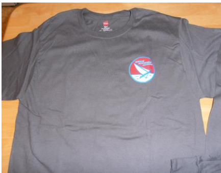
front of shirt

WSSA long sleeve t-shirts, $25.00 each plus shipping. Choice of three colors – charcoal, medium blue, and forest green. A colored WSSA logo is on the left side of chest, a stern steerer in a tall hike (thanks to Jeff Seeboth for the pose) is on the back. Send t-shirt orders to WSSA Secretary/Treasurer.