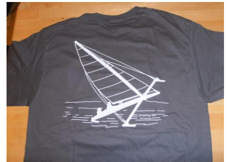
back of shirt

WSSA Website: www.iceboat.org/regattas/wssa/